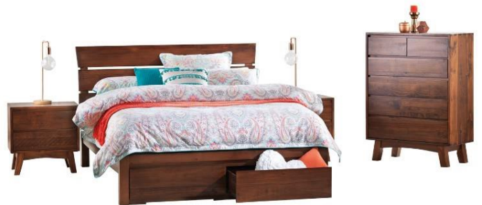
Actual Bedroom suite will be different from picture