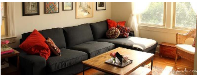
Actual Living Room suite will be different from picture