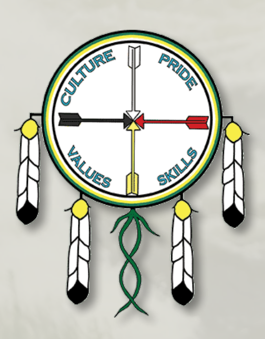
The agreement with Cameco allowed for additional funding to be provided to LLRIB members pursuing university, trade, and technical post-secondary programs. $150,000 was received between 50 students with LLRIB, Cameco, and Kitsaki Group of Businesses all contributing $50,000.