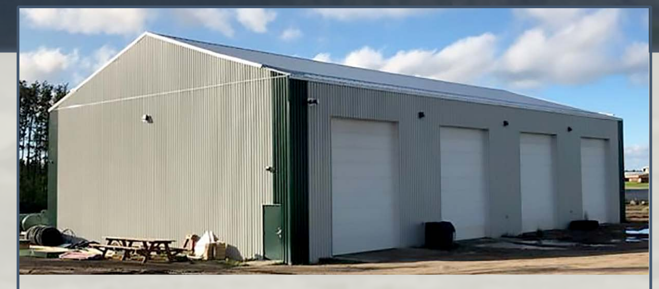
The LLRIB Community Trust contributed a significant amount towards the building of a maintenance and storage shop for Stanley Mission's Public Works Division. Equipment can now be stored and serviced safely.

The benefits of the collaboration agreement are demonstrated through a wide range of initiatives that have been made possible by the LLRIB Community Trust that receives investment payments based on Cameco's share of production at its mine sites. A local committee made up of LLRIB leadership and Elders receives applications from band administrators and decides on investments.